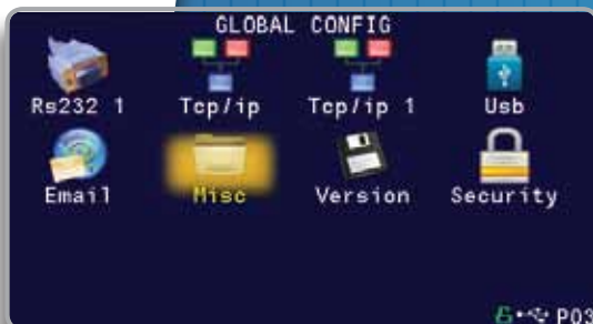
Flexible communications formats