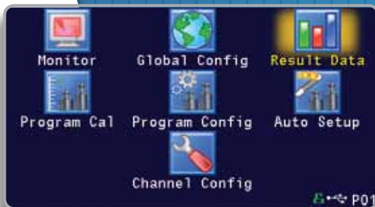
Simple intuitive operator interface